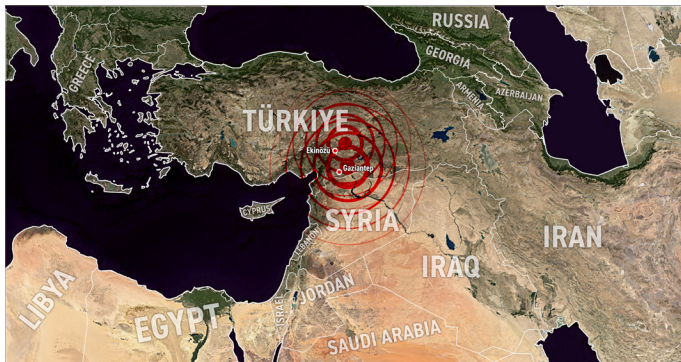
The 3D earthquake code Anelastic Wave Propagation code ran 3.7x faster on Intel Max Series CPU than on Frontera and showed a 100 percent boost with HBM. 1

The Intel Xeon CPU Max Series can run in a variety of modes—including an HBM-only mode and a flat mode where HBM can be turned off, relying only on DDR5. TACC tested the efficacy of the Intel Xeon CPU Max Series in both of these memory modes to understand the performance characteristics and benefits of HBM vs. DDR5. The Intel Xeon CPU Max Series delivered significant performance gains in both modes, especially for memory-bandwidth-bound applications.